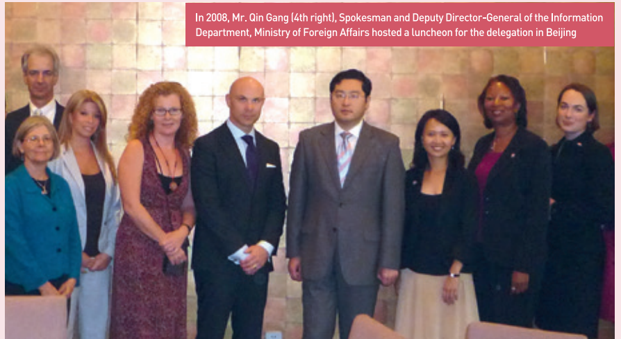
In 2008, Mr. Qin Gang (4th right), Spokesman and Deputy Director-General of the Information Department, Ministry of Foreign Affairs hosted a luncheon for the delegation in Beijing

Since 1996, in an effort to enhance the understanding of Mainland China and Hong Kong by the American media, the Foundation together with the East-West Center invite six to eight American journalists each year to visit Mainland China and Hong Kong. The Foundation sponsors and organizes their trips. With the support of the Ministry of Foreign Affairs of the PRC, the program enables the journalists to meet with senior government officials in Beijing as well as local municipal officials of some cities in the Mainland. To broaden participants' network, the Foundation also organizes meetings with local key industry and business players, academic and research institutions, and media practitioners. In 2010, the Foundation in collaboration with the All-China Journalists Association enriched the program by adding the visit of Chinese journalists to the U.S.