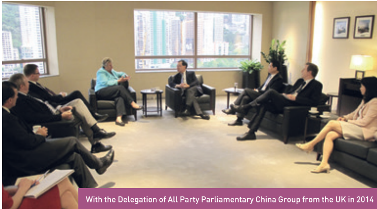
With the Delegation of All Party Parliamentary China Group from the UK in 2014