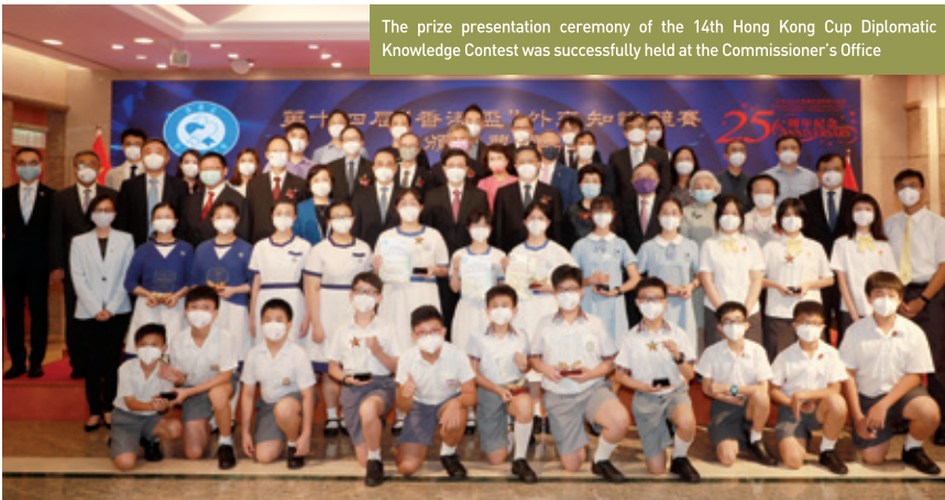
The prize presentation ceremony of the 14th Hong Kong Cup Diplomatic Knowledge Contest was successfully held at the Commissioner's Office