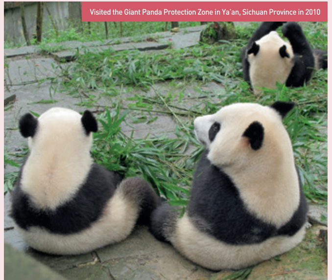
Visited the Giant Panda Protection Zone in Ya'an, Sichuan Province in 2010