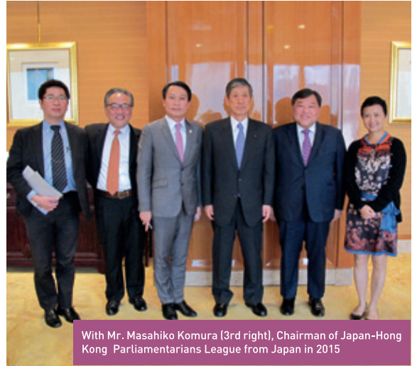
With Mr. Masahiko Komura (3rd right), Chairman of Japan-Hong Kong Parliamentarians League from Japan in 2015