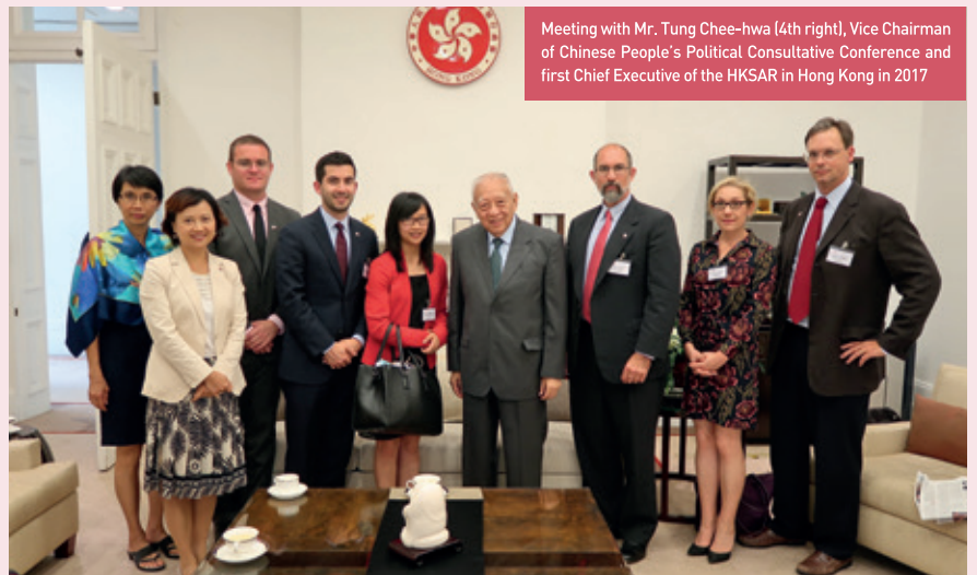
Meeting with Mr. Tung Chee-hwa (4th right), Vice Chairman of Chinese People's Political Consultative Conference and first Chief Executive of the HKSAR in Hong Kong in 2017