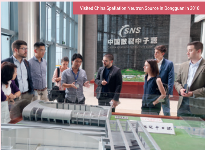
Visited China Spallation Neutron Source in Dongguan in 2018