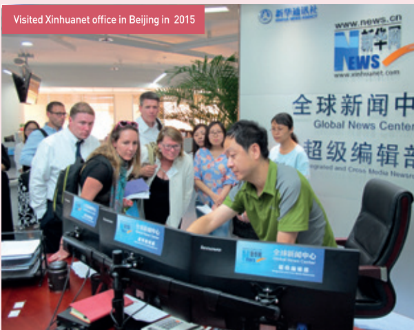
Visited Xinhuanet office in Beijing in 2015