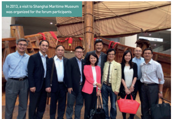
In 2013, a visit to Shanghai Maritime Museum was organized for the forum participants