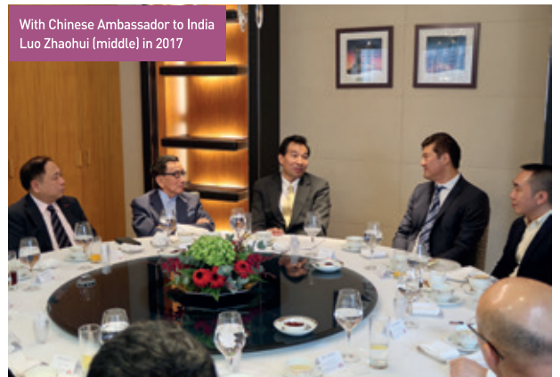
With Chinese Ambassador to India Luo Zhaohui (middle) in 2017