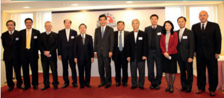
In 2011, the Foundation, together with the Chinese General Chamber of Commerce, the Chinese Manufacturers' Association of Hong Kong, the Federation of Hong Kong Industries, Hong Kong Chiu Chow Chamber of Commerce's Young Executives Committee, Hong Kong General Chamber of Commerce's China Committee and the Hong Kong General Chamber of Small and Medium Business, invited the Convenor of the Executive Council Mr. Leung Chun-ying (6th left) to share views on Hong Kong's future position under the national plan