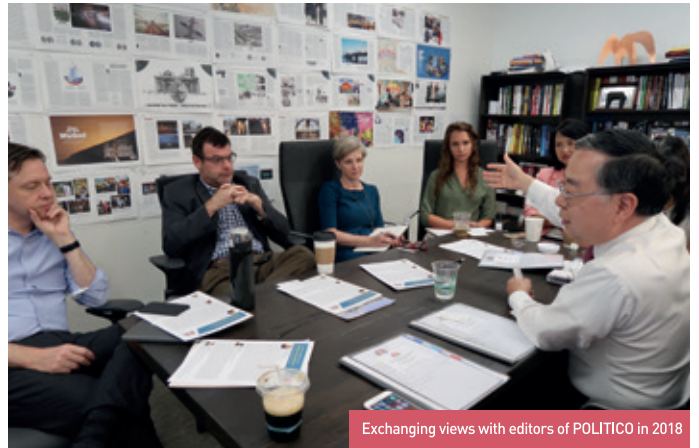
Exchanging views with editors of POLITICO in 2018