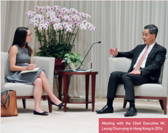
Meeting with the Chief Executive Mr. Leung Chun-ying in Hong Kong in 2016