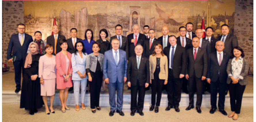
Conference on Turkey's history, investment environment and opportunities was organized for the delegation

The Foundation organized its first delegation to Turkey in September 2019, visiting Istanbul and Ankara. The delegation was able to meet with senior government officials and local business leaders to understand more about the investment opportunities and economic development in Turkey as well as to explore collaboration opportunities with Hong Kong.