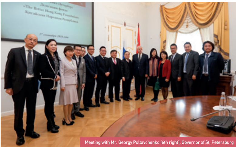
Meeting with Mr. Georgy Pottavchenko (6th right), Governor of St. Petersburg