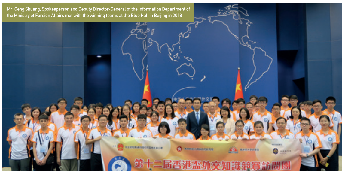
Mr. Geng Shuang, Spokesperson and Deputy Director-General of the Information Department of the Ministry of Foreign Affairs met with the winning teams at the Blue Hall in Beijing in 2018