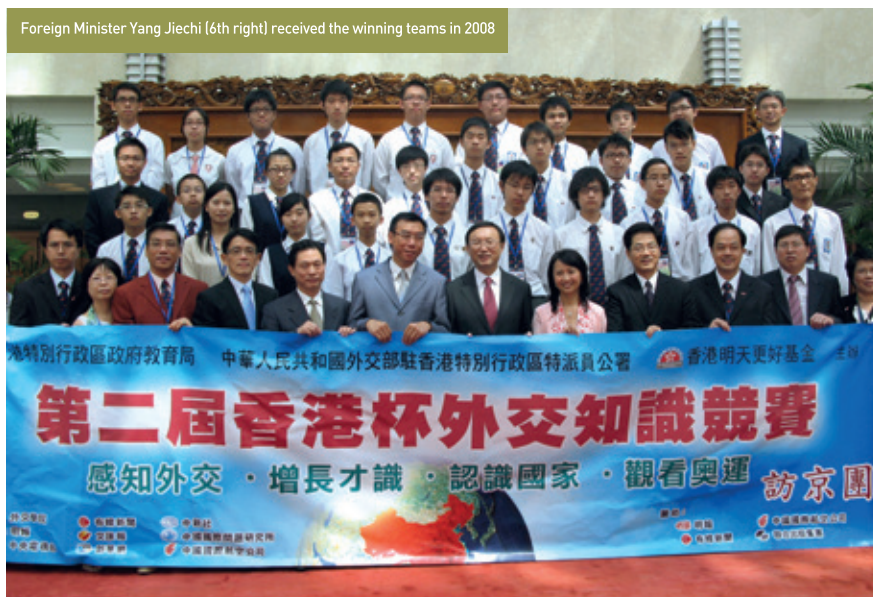
Foreign Minister Yang Jiechi (6th right) received the winning teams in 2008

Study tours to Beijing and other Mainland cities such as Shanghai, Harbin, Hohhot, Nanjing, Xi'an, Guiyang and more, have been organized for the winning teams of the contest. Through the contest, it is hoped that young people and the general public in Hong Kong will become more interested in learning about the development of China in the context of world diplomacy.