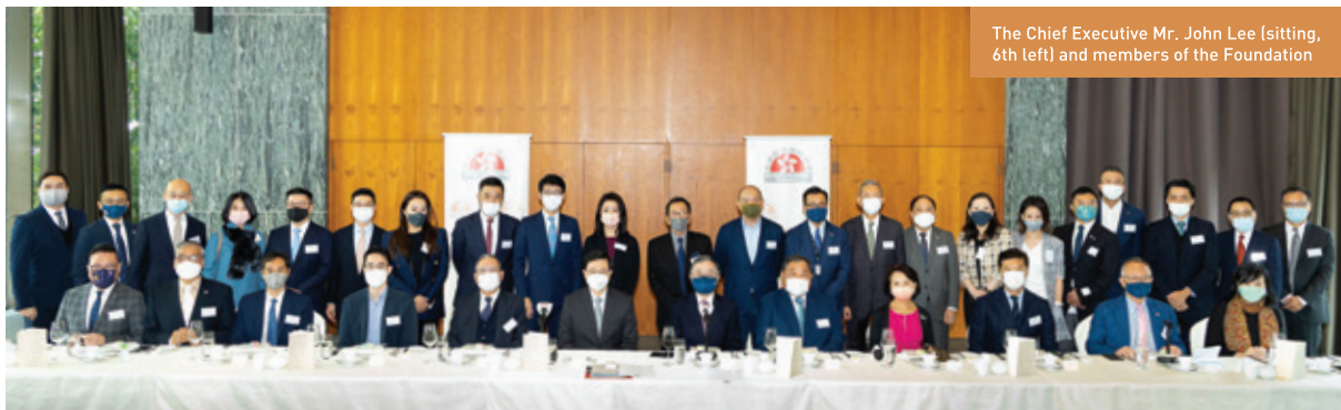
The Chief Executive Mr. John Lee (sitting, 6th left) and members of the Foundation