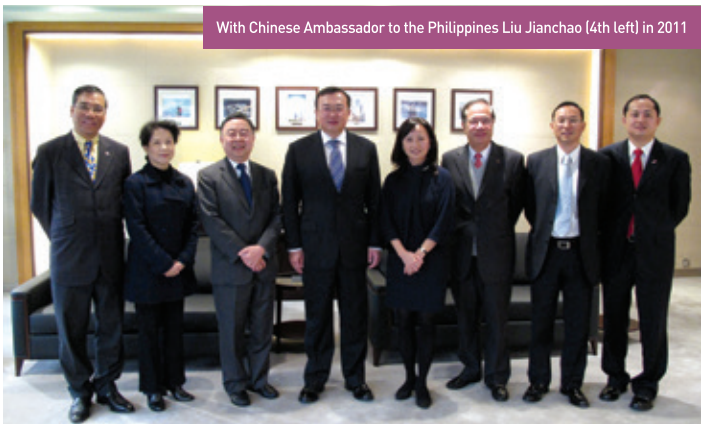
With Chinese Ambassador to the Philippines Liu Jianchao (4th left) in 2011