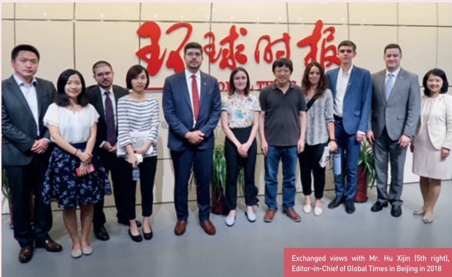
Exchanged views with Mr. Hu Xijin (5th right), Editor-in-Chief of Global Times in Beijing in 2018