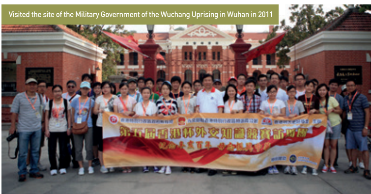
Visited the site of the Military Government of the Wuchang Uprising in Wuhan in 2011