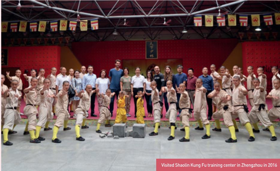
Visited Shaolin Kung Fu training center in Zhengzhou in 2016