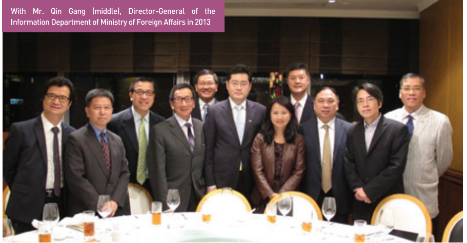
With Mr. Qin Gang (middle), Director-General of the Information Department of Ministry of Foreign Affairs in 2013