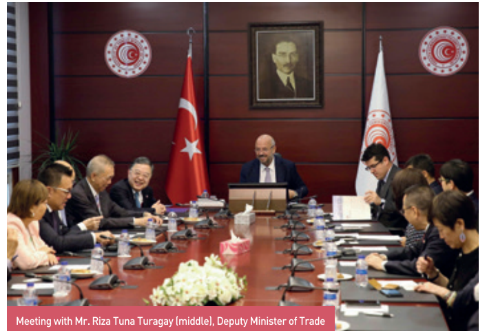
Meeting with Mr. Rıza Tuna Turagay (middle), Deputy Minister of Trade