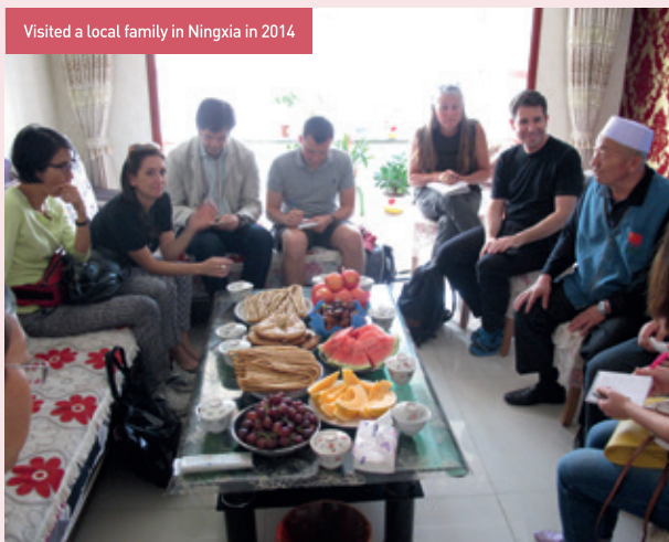
Visited a local family in Ningxia in 2014