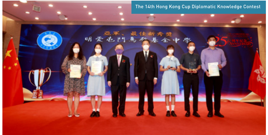
The 14th Hong Kong Cup Diplomatic Knowledge Contest

In October 2022, the 20th National Congress of the Chinese Communist Party ("CCP") was concluded successfully in which strategic plans were advanced to set out major goals and tasks for China's future development. On the one hand, common prosperity and the vital role of the government are necessary. The government has confirmed once again that it will continue encouraging and bolstering the development of the private economy and supporting the decisive role