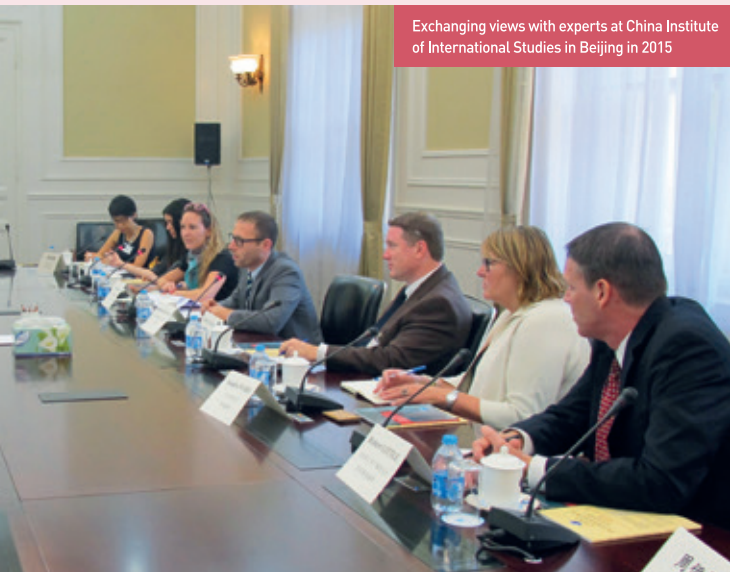
Exchanging views with experts at China Institute of International Studies in Beijing in 2015