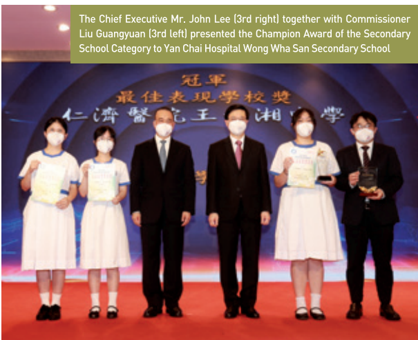
The Chief Executive Mr. John Lee (3rd right) together with Commissioner Liu Guangyuan (3rd left) presented the Champion Award of the Secondary School Category to Yan Chai Hospital Wong Wha San Secondary School