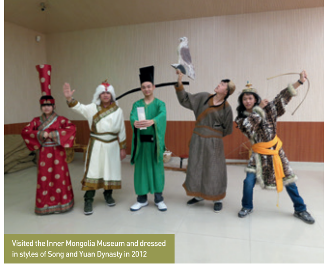
Visited the Inner Mongolia Museum and dressed in styles of Song and Yuan Dynasty in 2012