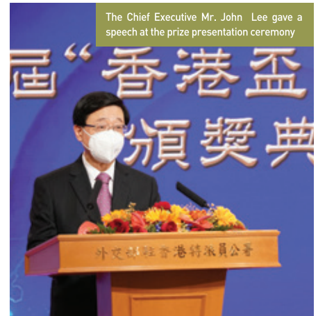
The Chief Executive Mr. John Lee gave a speech at the prize presentation ceremony