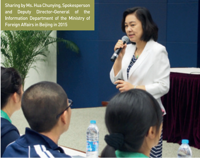
Sharing by Ms. Hua Chunying, Spokesperson and Deputy Director-General of the Information Department of the Ministry of Foreign Affairs in Beijing in 2015