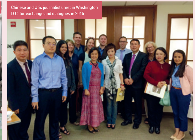
Chinese and U.S. journalists met in Washington D.C. for exchange and dialogues in 2015