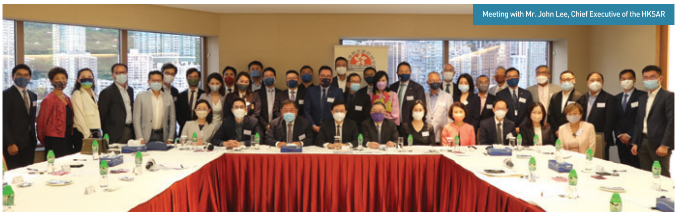
Meeting with Mr. John Lee, Chief Executive of the HKSAR

approved in 2021, Hong Kong is to reinforce and enhance its competitive edges and advance the development of the Guangdong-Hong Kong-Macao Greater Bay Area ("GBA"). Hong Kong will become a proactive "participant" in the domestic circulation and a proactive "facilitator" for the international circulation in the "dual circulation" development strategy. Eight areas and designations have been identified for further enhancement and growth: International Financial Center; International Transportation Center; International Trade Center; Center for International Legal and Dispute Resolution Services in Asia-Pacific; International Aviation Hub; International I&T Hub; East-meets-West Center for International Cultural Exchange; and Regional Intellectual Properties (IP) Trading Center. Furthermore, as an international financial center, Hong Kong will play a more proactive role in the country's strategic plan, including strengthening its position as the key offshore Renminbi ("RMB") center.