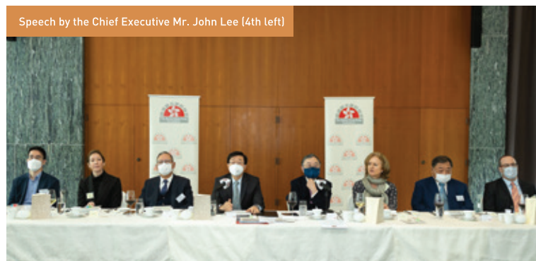
Speech by the Chief Executive Mr. John Lee (4th left)