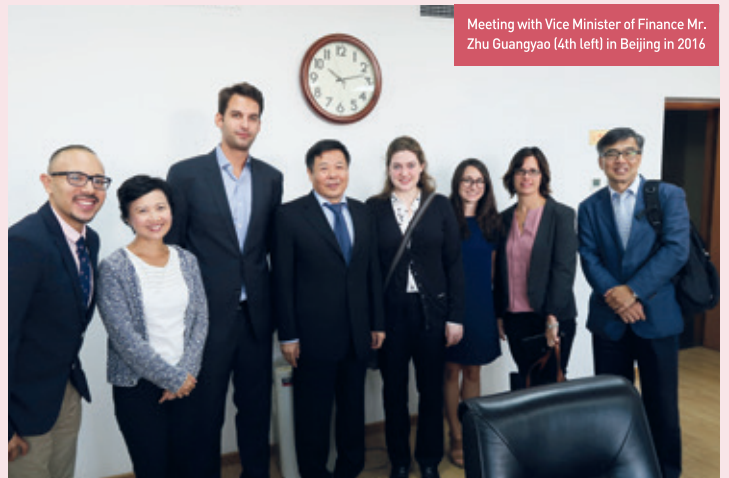
Meeting with Vice Minister of Finance Mr. Zhu Guangyao (4th left) in Beijing in 2016