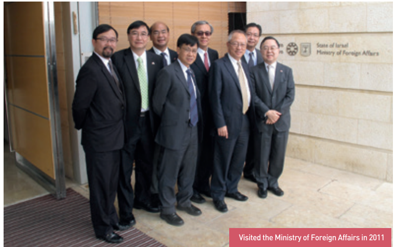
Visited the Ministry of Foreign Affairs in 2011