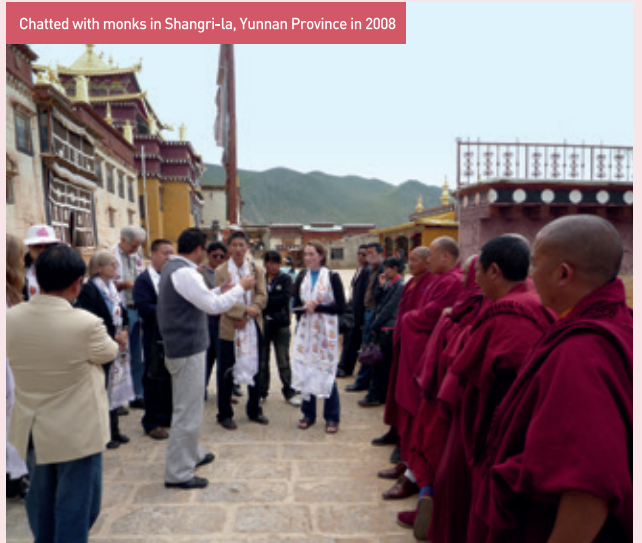
Chatted with monks in Shangri-la, Yunnan Province in 2008