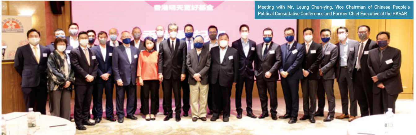
Meeting with Mr. Leung Chun-ying, Vice Chairman of Chinese People's Political Consultative Conference and Former Chief Executive of the HKSAR