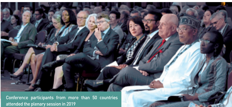
Conference participants from more than 50 countries attended the plenary session in 2019